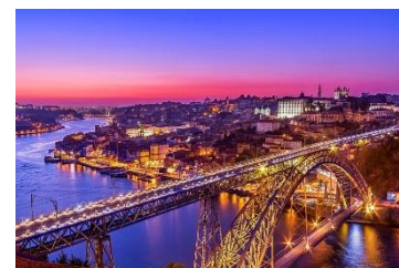
Don Luís Bridge

The Don Luís Bridge is na architectural mettalic structure with two trays, built from 1881 to 1888 in order to connect the cities of Porto and Vila Nova de Gaia, separated by the Douro River.